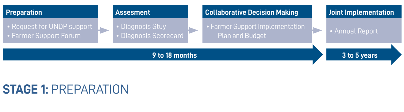
Figure 5: Preparation stage overview