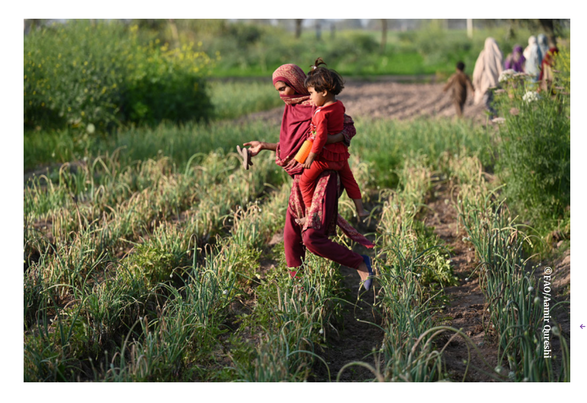
PAKISTAN – A woman holds her daughter as she arrives to work at a vegetable field.