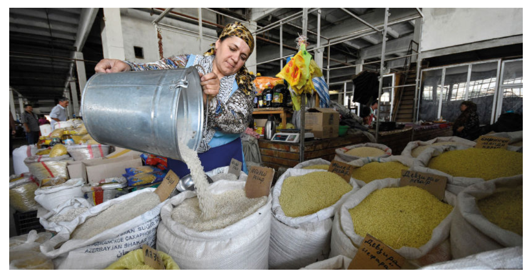
16 August 2016, Hissar, Tajikistan – FAO project enhanced government's capacities in Agrarian Reform and support the development of the agriculture and rural sector in Tajikistan.

The City Region Food System Toolkit<sup>75</sup>, for instance, highlights several steps, covering: an initial scan of secondary data and stakeholder interviews or focus groups for an identification of priority issues, as well as gaps for further research with primary data collection. This is followed by additional data collection and research and may involve the re-interpretation of secondary data. Well-designed data display is then developed in order to share the results of the assessment phase and prepare multi-stakeholder action planning.