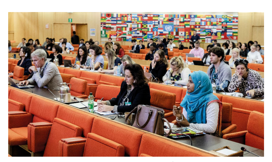
17 October 2019, Rome, Italy - CFS 46 Side-Event on data and information systems can empower family farmers, advance goals of the United Nations Decade of Family Farming (UNDFF) and guide better policy.