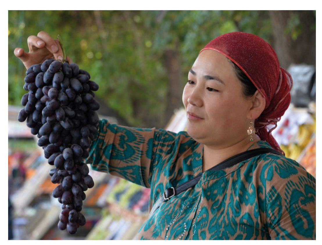
A Woman sells vegetables and fruits on the road near Kant 20 km from Bishkek, Kyrgyzstan on 22 August 2016.