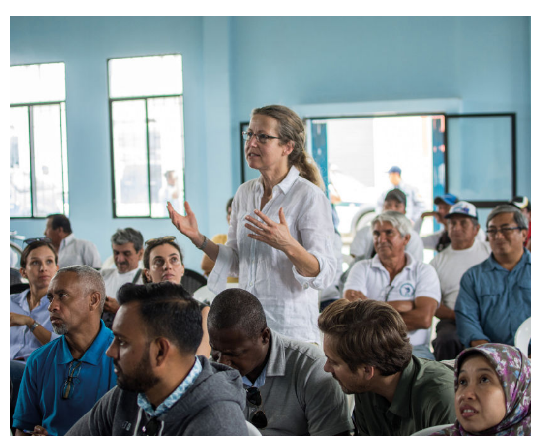
26 October 2018, Guayaquil, Ecuador – Multi-partners "Coastal Fisheries Initiative (CFI)" to promote sustainable fisheries management practices aimed at building vibrant coastal communities in Ecuador.

This section examines concrete ways to help stakeholders agree on a shared vision and, from that, develop realistic action plans with a clear strategic view behind them.