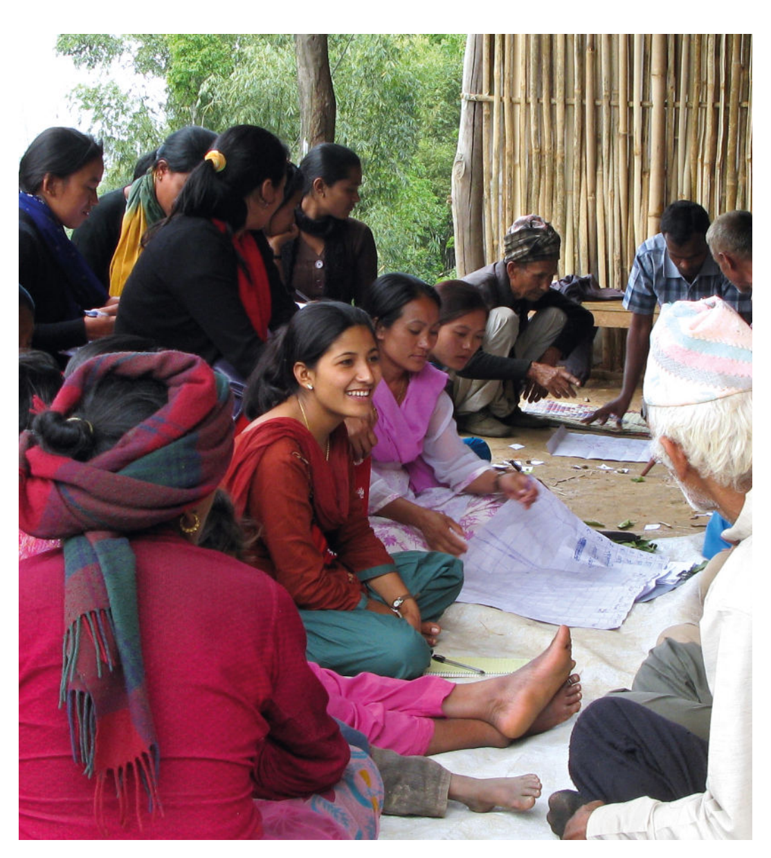
Discussion with rural women. Agriculture in Nepal.

>> Annex 1, Building Block 5 provides a list of tools and resources for financing MSC initiatives.