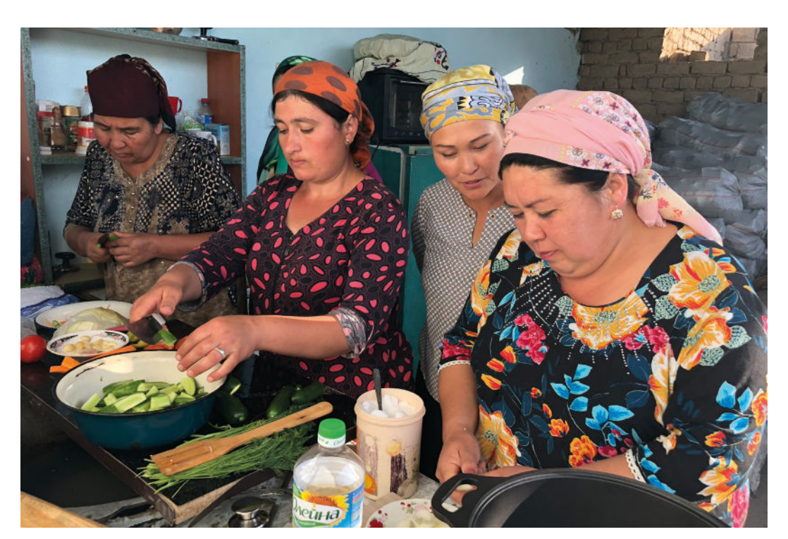
As part of community-based nutrition education sessions, beneficiaries of FAO Productive Social Contract / Cash+ pilot project learn how to improve traditional dishes to enhance their dietary diversity and address nutritional needs.

Building Block 3 provides more insights into capacity-building for MSC engagement (see also related tools and resources in >> Annex 1, Building Block 3).