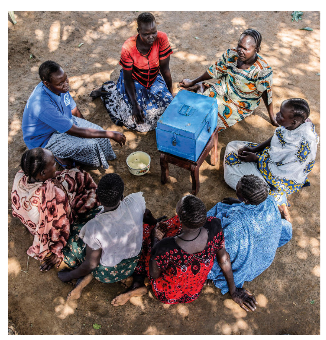
29 May 2018, Torit, South Sudan - FAO Agropastoral field schools (APFS) project provided a flexible and responsive platform for building the knowledge and skills of farmers and livestock keepers of all ages in South Sudan.

Once action plans, as described above, have been put into motion, a monitoring and evaluation (M&E) system will be required to continuously monitor the initiative's success and to evaluate learnings for any adjustments needed to the strategy. The M&E process will also require the allocation and embedding of resources (i.e., time, funds and human resources) within the action plan. When technical competencies on M&E are not available, capacity-building from development partners may be provided, or expertise hired. It is also important that M&E is internalized in the initiative, so that it is not perceived as a standalone reporting task.