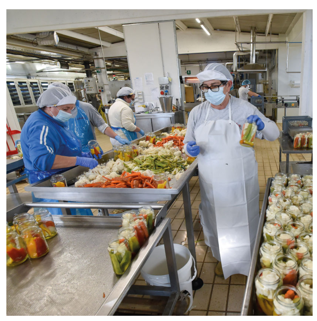
24 November 2021, Albinia (Tuscany), Italy - Workers of La Selva organic farm preparing canned vegetables.

Communication is a core pillar of any MSC initiative, requiring a variety of processes to engage people and develop understanding, consensus, ownership, meaningful alliances and strong partnerships. PC Communication takes place on a range of levels – for instance, through individuals, where the quality of personal interactions will depend on the extent to which individuals listen and engage in dialogue; as well as collectively, where stakeholders develop and communicate a common message to contribute to change. Several challenges that can adversely affect communication include: divergent views and preconceived ideas, not listening to others, lack of trust, and an unconducive environment for sharing experiences and discussion. Repetition of the service of trust, and an unconducive environment for sharing experiences and discussion.