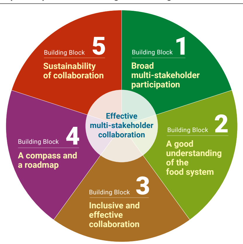
Figure 1. Graphical representation of the guide's Building Blocks