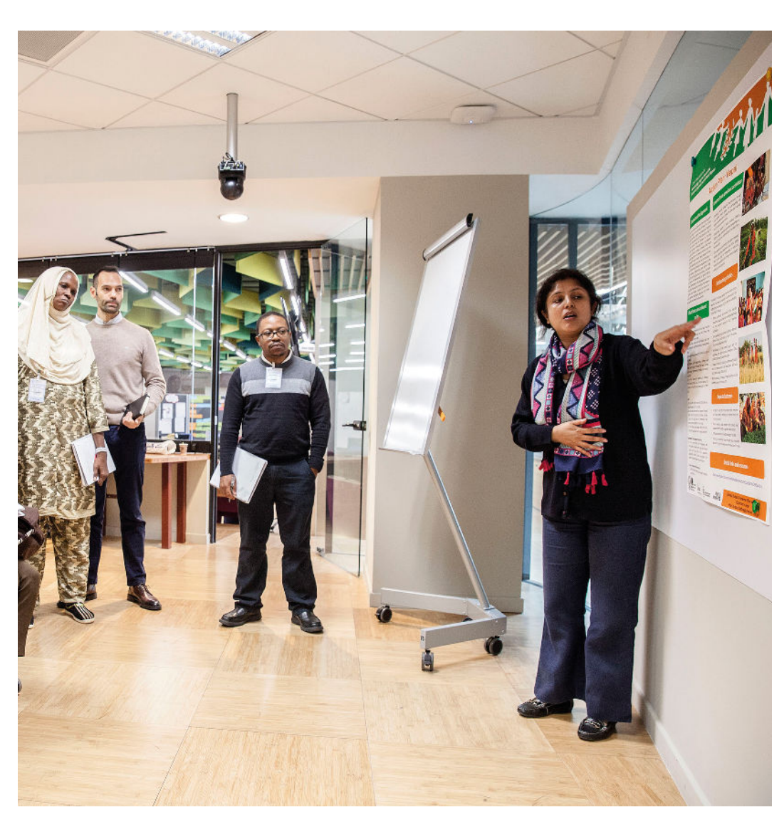
23 February 2017, Rome Italy - Workshop: Accelerating progress towards the economic empowerment of rural women with 7 country coordinators from the UN Joint Programme (FAO, IFAD, WFP and UN Women), FAO headquarters (Iraq Room).