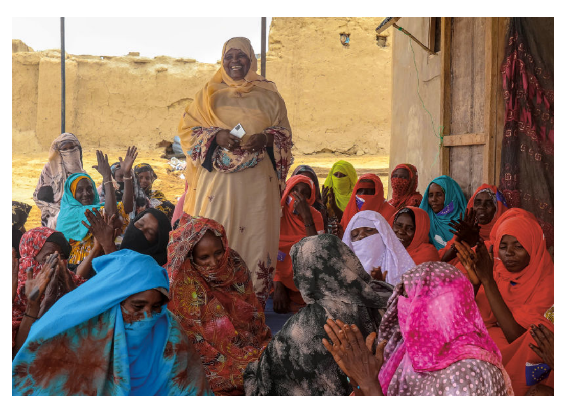
Community-based conflict resolution communities in Kanem gathering to fight against malnutrition.

However, the participation of all non-governmental organizations cannot be considered the same, with efforts needed to include the direct representatives of marginalized groups. 53 Also there is the risk that "civil society" participation could be skewed in favour of non-governmental organizations that are better resourced and with better capacities. In addition, some non-governmental organizations may lack a clear mandate for the groups they are representing. 54 Consumers are also an important actor in the agrifood system, but their voice can also be absent from the dialogue table. Involving consumers' organizations in MSC initiatives can help to raise awareness among citizens of the opportunities and challenges facing the food system and the role they can play in shaping a sustainable food system.