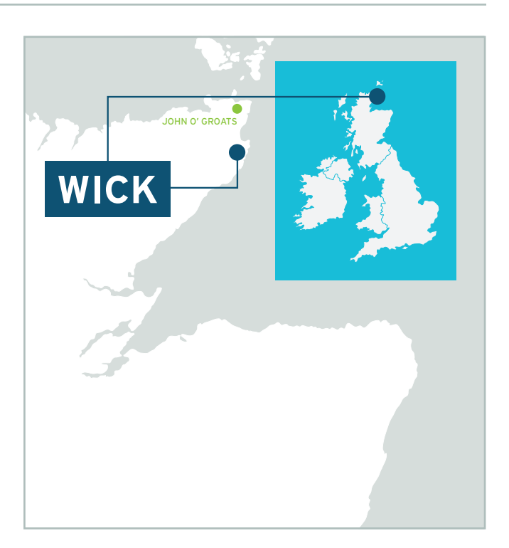
Figure 2. Map of Caithness, with Wick

The discharged water, after it has passed through the water treatment plant in Wick, was tested by the Environmental Research Institute (ERI) in a baseline study during implementation of the AWS Standard<sup>15</sup>. This test revealed the extent of pharmaceutical residues, discharged by the hospital (as well as from local households<sup>16</sup>), still present in the water after treatment<sup>17</sup>. That is the case for similar water treatment plants in the UK and elsewhere in Europe. Professor Stuart Gibb of ERI pointed out that<sup>18</sup>: