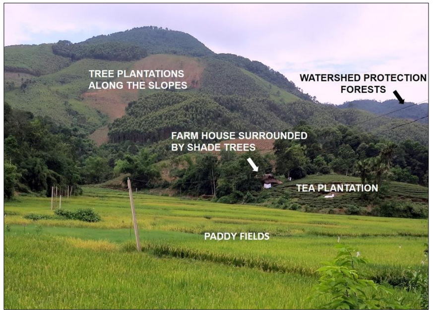
Figure 2. Typical agriculture-forest mosaic landscape in Yen Bai Province, Vietnam

During the same period, Vietnam has also established a flourishing wooden furniture industry, with some 3,000 small and medium-sized enterprises earning about USD10.3 billion in exports in 2019, marking an increase of 22% compared to 2018 (VIFOREST et al., 2020). However, as the bulk of domestically grown timber is of low value and is non-certified, Vietnam's furniture industry depends as much as 80% on foreign wood supply. In response, the GoV has pushed for an increase in the share of high-quality and certified domestic wood supply from plantations (Hoang et al., 2015b, Pistorius et al., 2016).