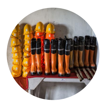
Table 4 highlights good practices of various sustainability initiatives relating to governance and assurance processes, specifically with regard to FPIC and the involvement of indigenous peoples, as highlighted in the selected literature.

ASI's Indigenous Peoples Advisory Forum (IPAF) and FSC's Permanent Indigenous Peoples Committee (PIPC) are considered to be good practice (Annandale et al 2018). Representation on such forums should be via self-selection and the forum should have clearly defined Terms of Reference that include participation in standard-setting and review, audits, the assessment and resolution of complaints from Indigenous peoples, and the preparation of regularly updated information materials for Indigenous peoples (ibid).